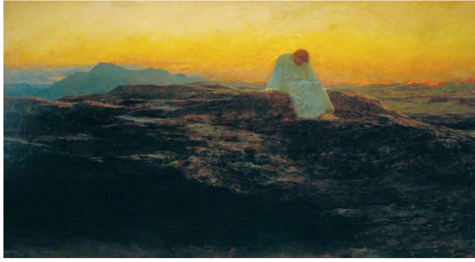
THE CHURCH GATHERS AND PREPARES . . .