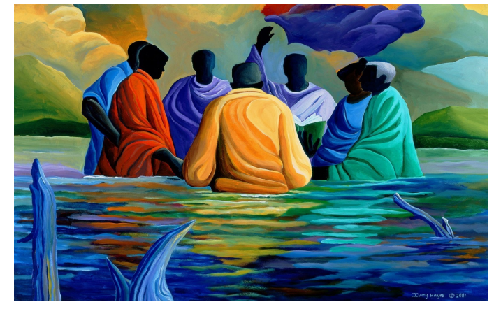
THE CHURCH GATHERS AND PREPARES . . .